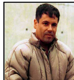
Joaquin "Chapo" GUZMAN LOERA Identified by the President as a significant foreign narcotics trafficker on June 1, 2001

Responsible for multi-ton drug shipments from Sinaloa, Mexico into the U.S.