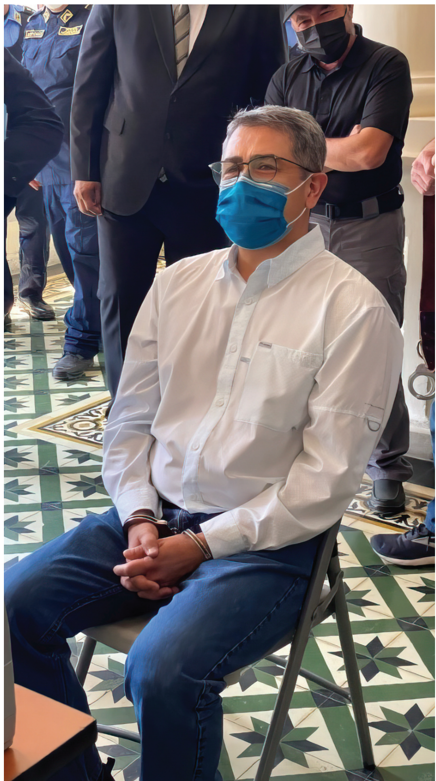
Honduran Immigration authorities processed former Honduran president, Juan Orlando Hernandez-Alvarado prior to his departure from Honduras to the U.S. on a DEA aircraft.

Hernandez-Alvarado served for approximately eight years as president of Honduras as well as president of the National Congress of Honduras. To help finance his political ambitions, Hernandez received millions of dollars from multiple DTOs operating in Honduras, Mexico, and elsewhere, including from the former leader of the Sinaloa Cartel, Chapo Guzmán. SDNY prosecutors alleged that from 2004 to approximately 2022, Hernandez participated in a violent drug-trafficking conspiracy to facilitate the importation of over 500,000 kilograms of cocaine into the U.S. Hernandez stands accused of providing his brother and other drug traffickers protection from arrest and investigation in Honduras, the sharing of information that enabled safe passage for large cocaine shipments, and political protection from extradition to the United States. If convicted on all charges, Hernandez is facing 40 years to life in prison. Attorney General Merrick Garland stated “We allege that Hernandez corrupted legitimate public institutions in the country - including parts of the national police, military, and national Congress.”