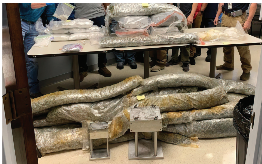
As part of Operation Crystal Shield, agents from DEA’s Lafayette Post of Duty seized 150 pounds of marijuana and 27 to 30 pounds of crystal methamphetamine.

In March 2020, DEA Fresno, California began an investigation into a suspected fentanyl poisoning at a local high school. This case led to the creation of the Fentanyl Overdose Resolution Team (FORT), a multiagency group consisting of DEA, HSI, and the Fresno Police Department. Since its inception, the group responded to over 160 fentanyl poisonings, 80 of which were fatal. FORT worked closely with victims’ families, often leading to continued partnerships to conduct fentanyl awareness education throughout the community. In addition, FORT coordinated