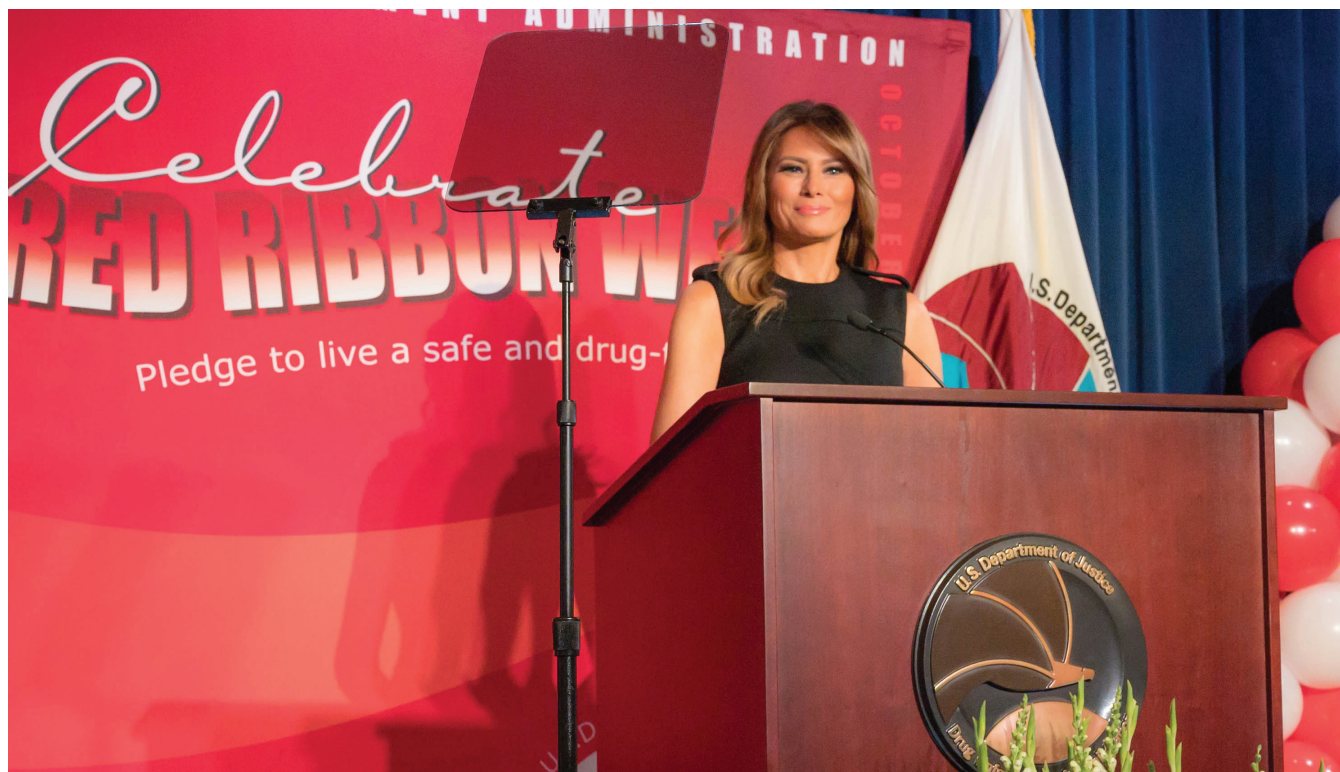
First Lady Melania Trump spoke at the 2019 Red Ribbon Rally and assisted in the award ceremony for DEA's Visual Arts Contest and Community Drug Prevention Awards.