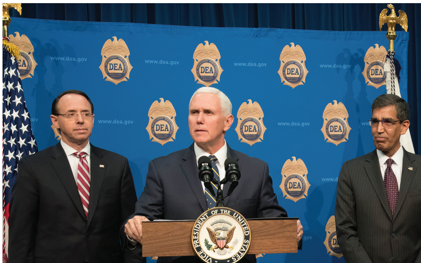
Then Vice President Pence gave a speech thanking DEA employees saying, "It's amazing to think that every day men and women of the DEA serve on the frontlines of law enforcement here at home and in 69 other countries around the world..."

U.S. Vice President Michael Pence visited DEA Headquarters on January 31, 2019, to thank the men and women of DEA for their work and dedication in federal drug law enforcement. This was the first time since 1988 that a vice president, then George H.W. Bush, visited DEA Headquarters. Bush also visited DEA Headquarters in 1991 and DEA's New York Division in 1989, but both times as sitting president.