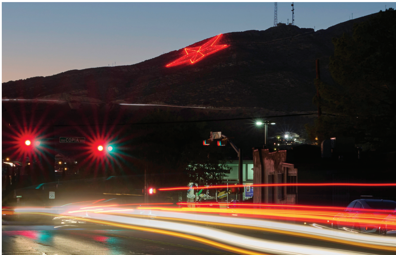
There is a star on the Franklin Mountains that illuminates El Paso year-round. During Red Ribbon Week, it shines red. Photo by Brian Wancho. Used with permission.

In 2021, after more than two years of careful work during the pandemic, the DEA Museum reopened on November 4th. The original museum, which debuted in 1999, was