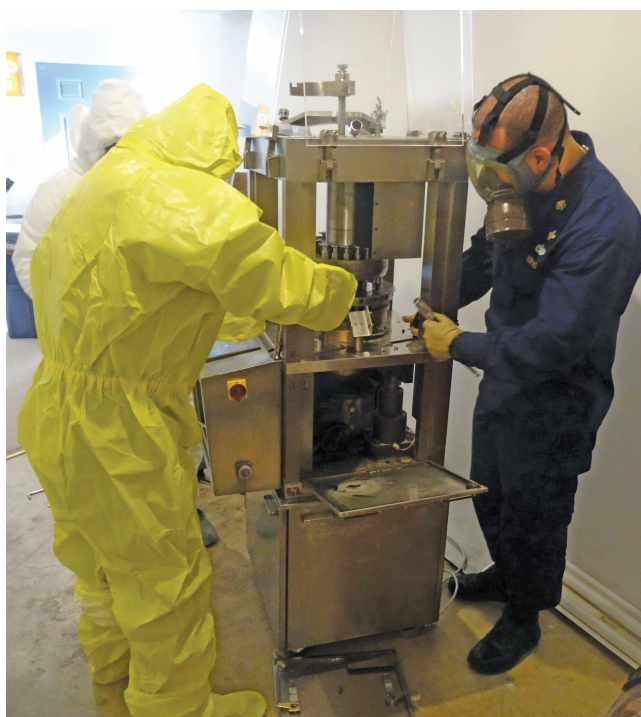
In January 2018, DEA's Baltimore Tactical Diversion Squad seized a 20-station pill press capable of making 24,000 pills per hour.

From 2016 to 2022, DEA's Baltimore Tactical Diversion Squad Group 50, with the help of the Virtual Currency Unit, took down a large counterfeit Xanax DTO. The operation resulted in the seizure of approximately $18 million in crypto currency, $1.5 million in U.S. currency, $1 million in computer hardware, a 20-station pill press, large amounts of alprazolam (purchased from China), other drugs (including fentanyl), 11 weapons, and 2 vehicles. With the additional assistance of DEA Memphis and Orlando District Offices, Baltimore DO Group 50 subsequently located and seized over $132.55 million from two virtual wallets (ledgers) containing 2,932 bitcoins.