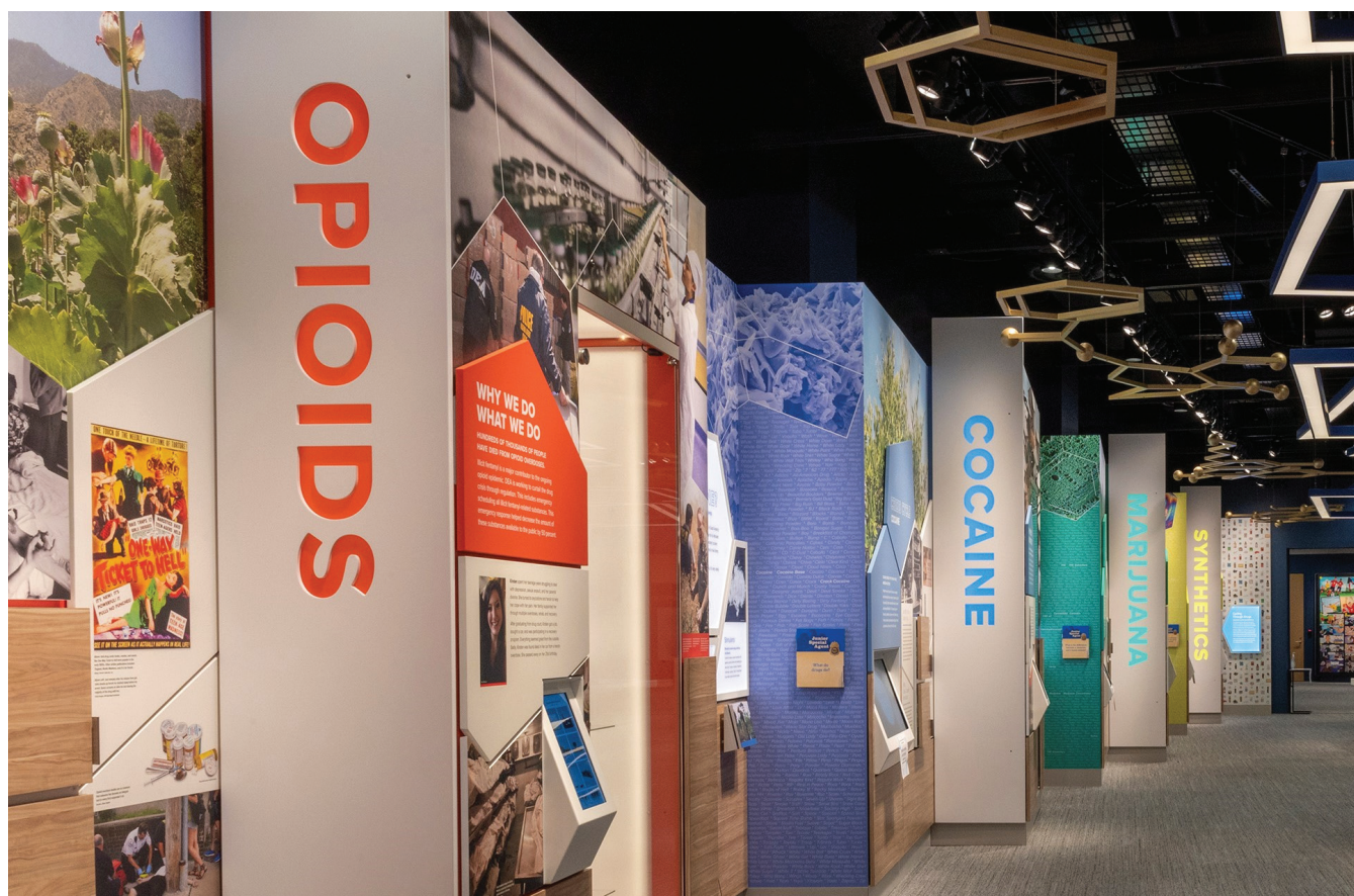
In the renovated DEA Museum, visitors can explore the history of opioids, marijuana, cocaine, and synthetic drug use in the United States.

In June 2019, Congress approved the opening of DEA’s Kyiv Country Office (CO). The Kyiv CO opened in April