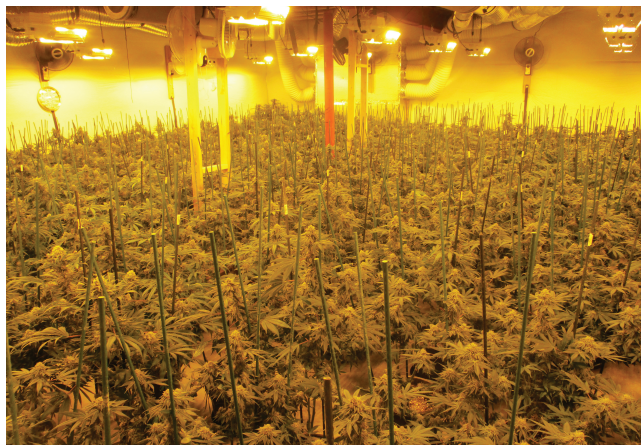
This is one of many marijuana cultivation sites seized from a residential basement as part of Operation Syndicate Green.

In the summer of 2016, Operation Syndicate Green began targeting an interstate marijuana trafficking organization that engaged in violence and other crimes in the Denver Metropolitan area. Over the years every phase of Operation Syndicate Green netted record-breaking marijuana and money seizures. A large-scale effort supported by numerous federal, state, and local law enforcement agencies throughout the Denver area, its investigators passed leads to DEA offices throughout the country. The Syndicate Green organizations distributed tens of thousands of pounds of marijuana outside Colorado; its illicit product was sourced by a vast network of Chinese marijuana growers producing thousands of pounds per month for illegal distribution.