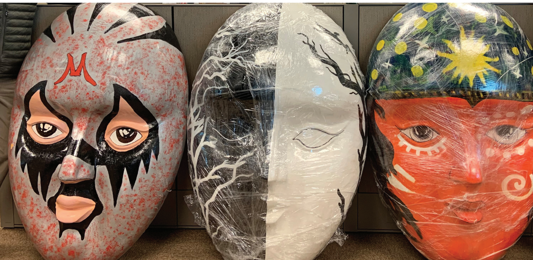
Three smaller masks seized and found to contain methamphetamine.

The advent of decentralized digital currency, like Bitcoin, changed the way that worldwide financial transactions take place. Unfortunately, it didn't take criminals long to find illicit ways to exploit this burgeoning technology. Silk Road, a dark web marketplace designed to facilitate