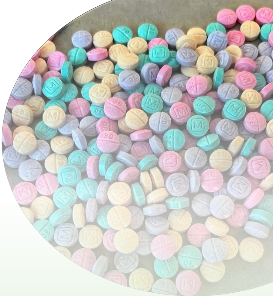
Fentanyl-laced rainbow-colored fake pills