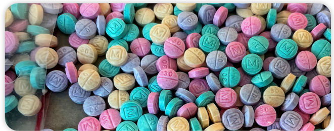
*FAKE rainbow oxycodone M30 tablets containing fentanyl